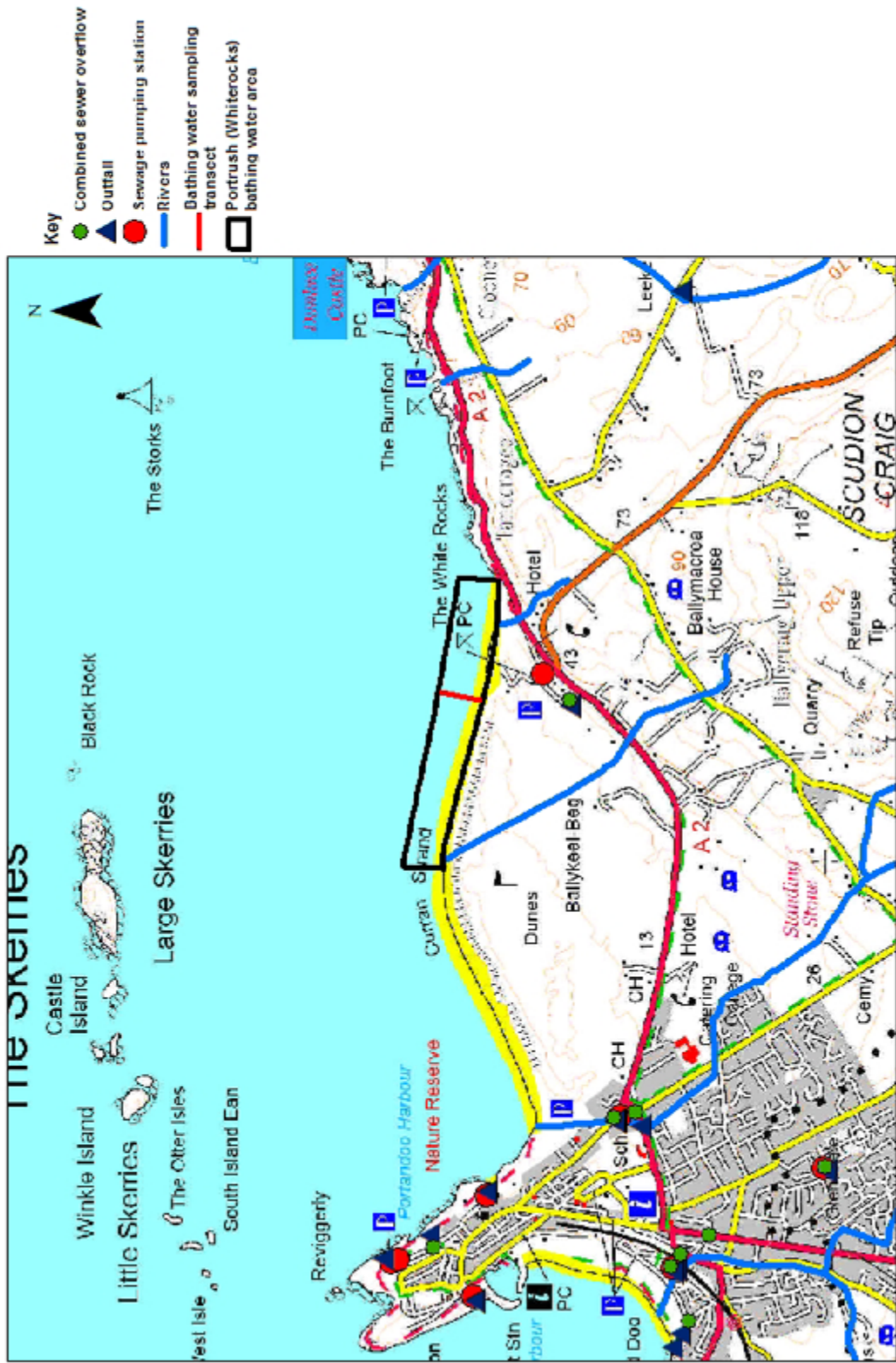
Map 1 Whiterocks Bathing Water - Potential Pollution Sources