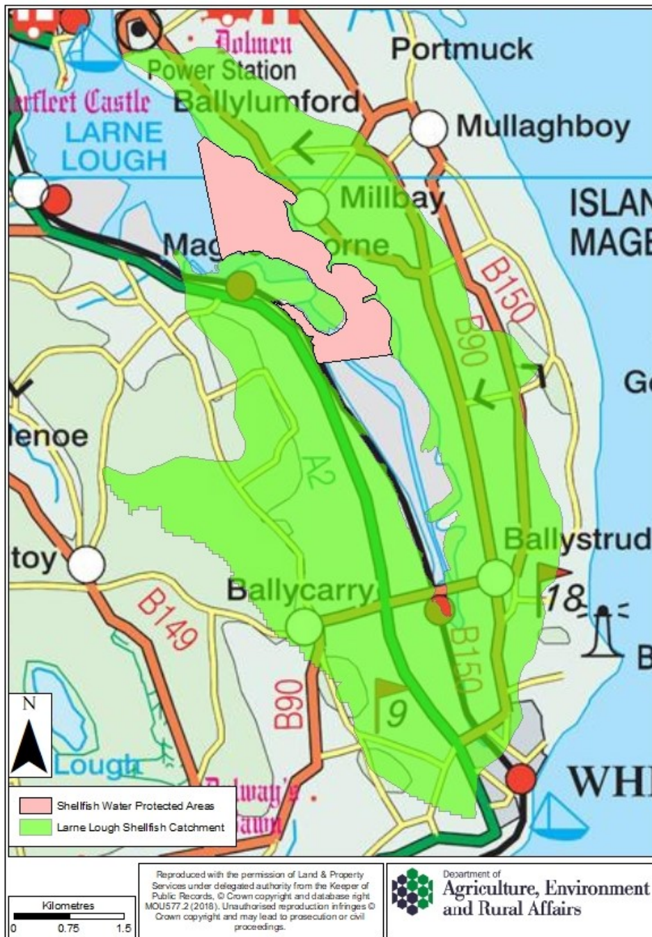
Figure 1. Catchment Areas Draining into Larne Lough