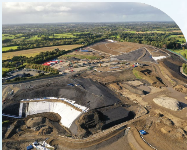
Current: Nov 2021