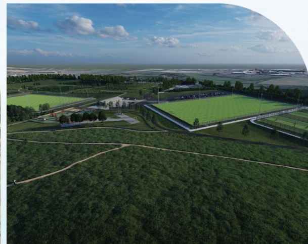
Future: Vision for Kerdiffstown