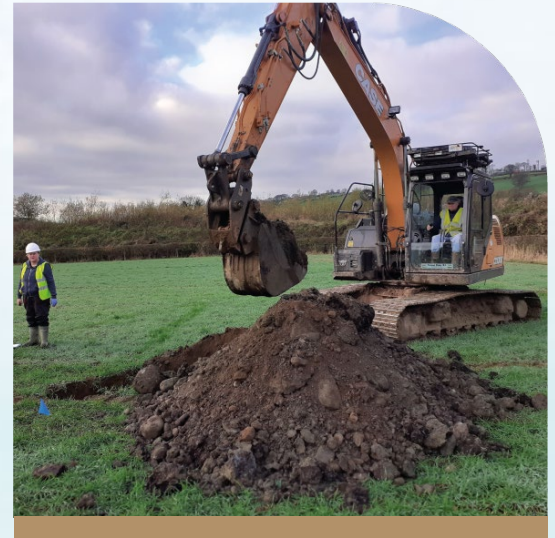
Trial Pit – Nov 21