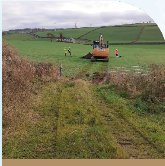
Trial Pit – Nov 21