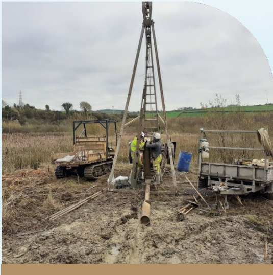
Drilling of Borehole – Nov 21

Photo of current SI works – clear live evidence of what is happening right now on site