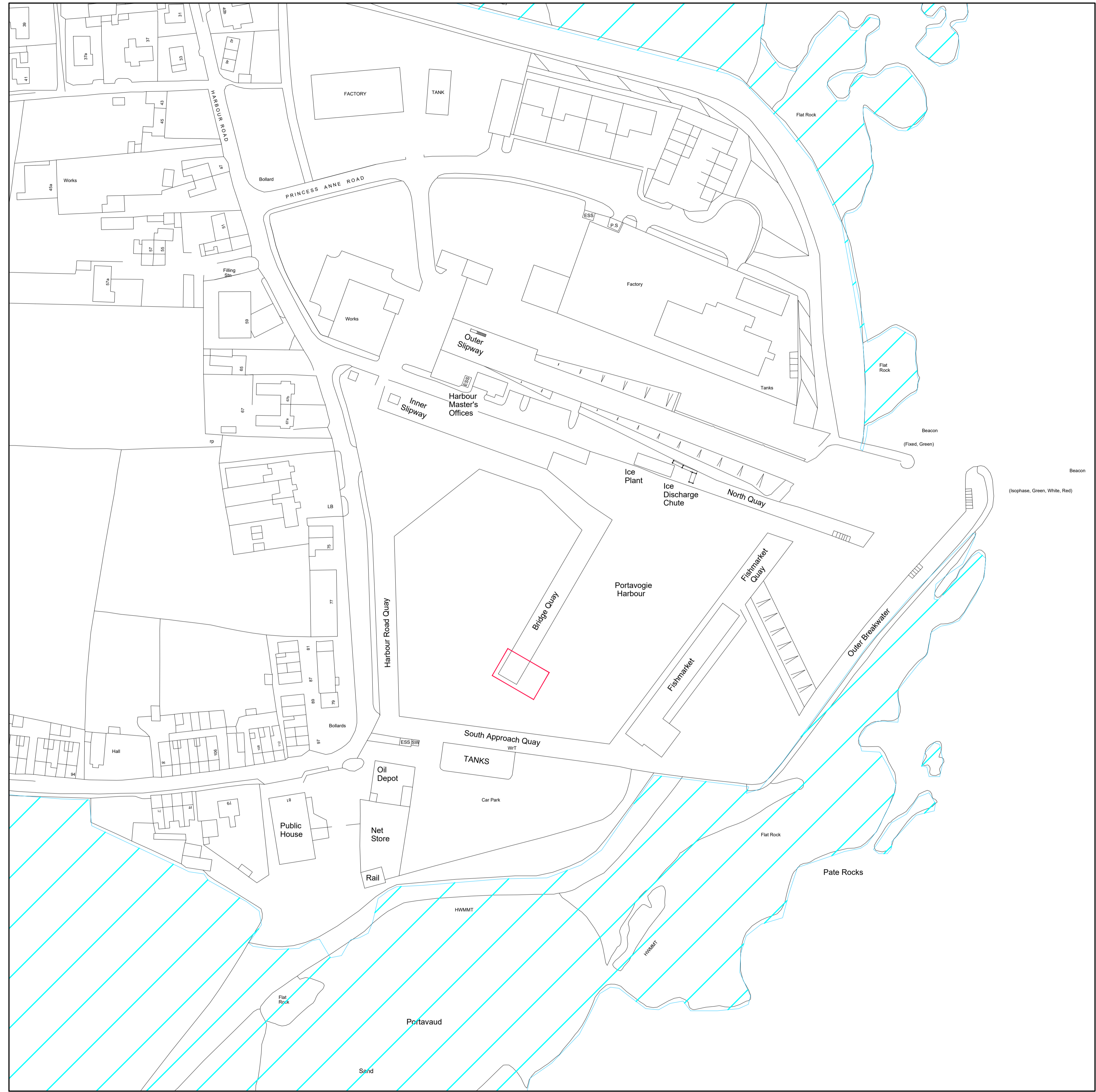
SPA Sites Plan 1:1000