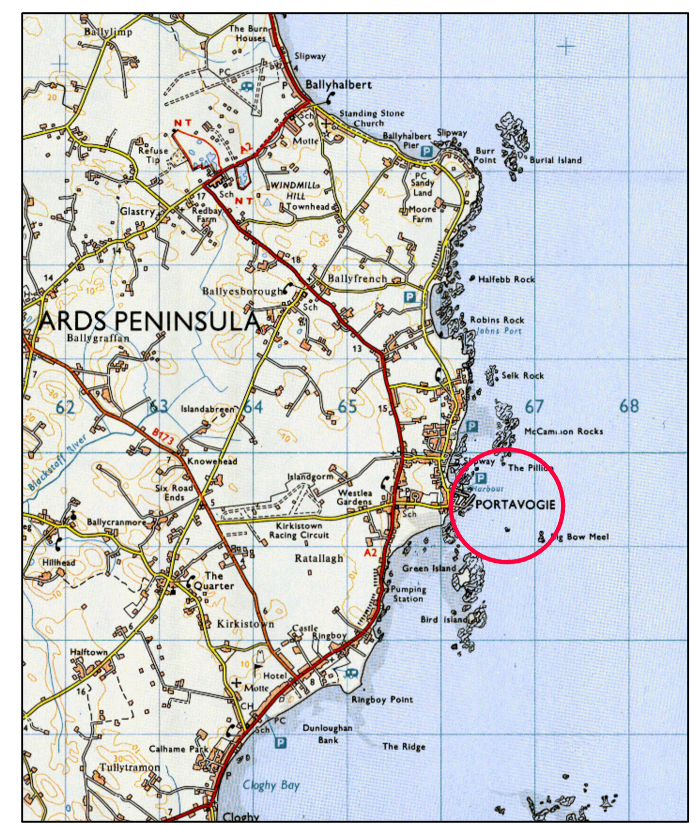
Site Location Plan 1:50,000