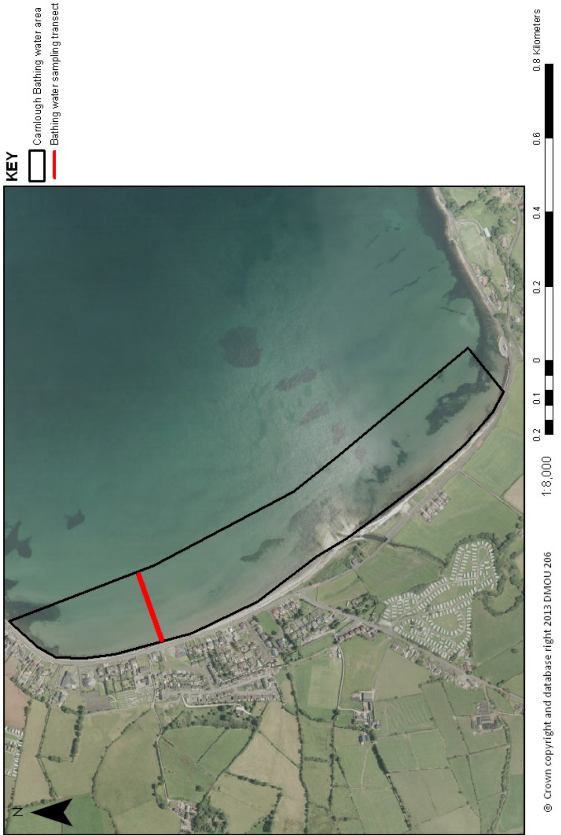
Map 2 Carnlough Bathing Water - EC Bathing Water Sample Location