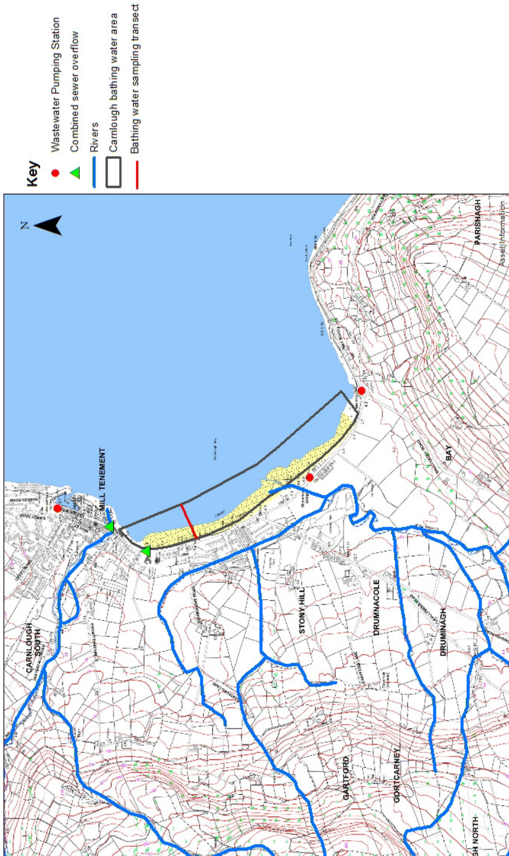
Map 1 Carnlough Bathing Water - Potential Pollution Sources