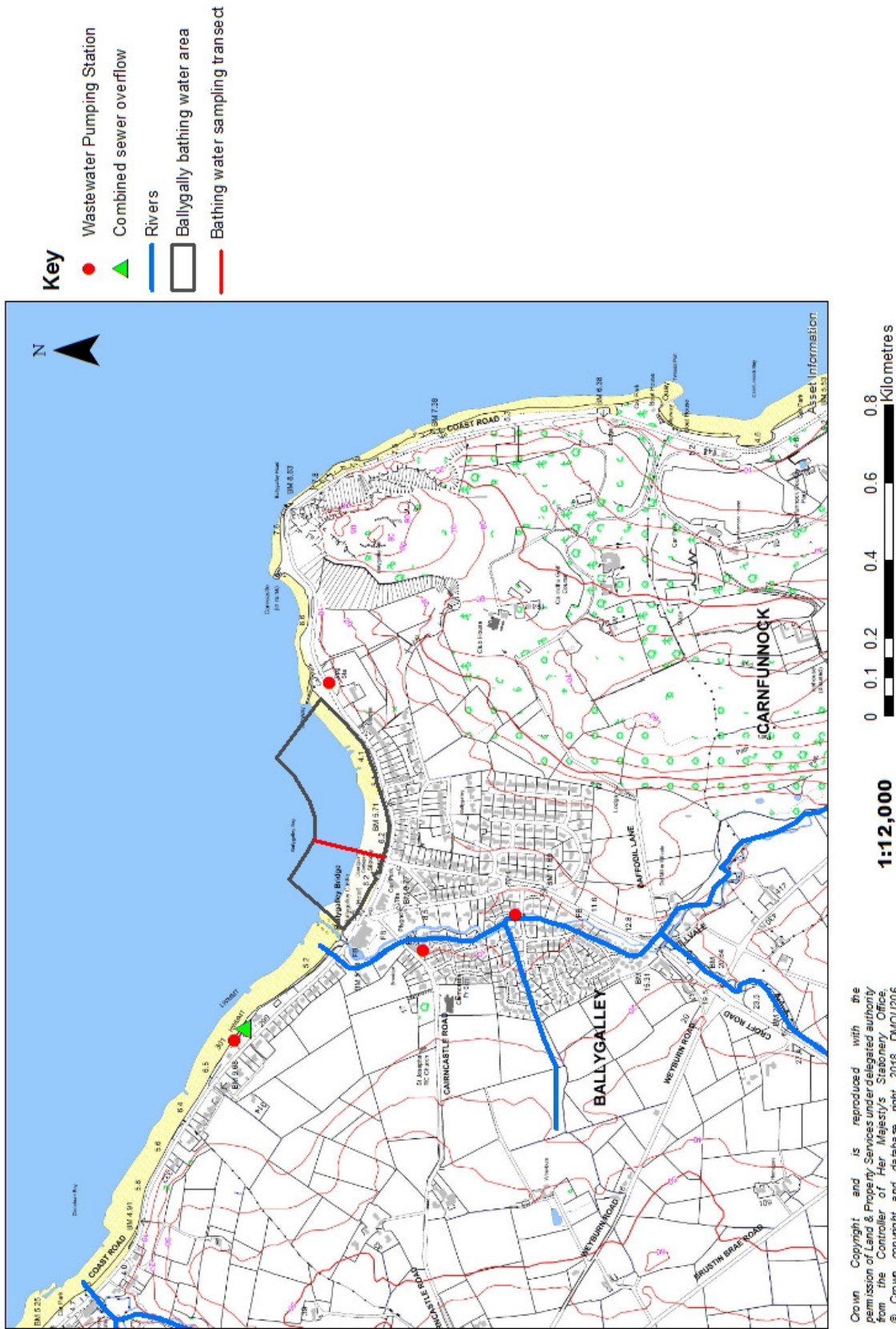
Map 1 Ballygally Bathing Water - Potential Pollution Sources